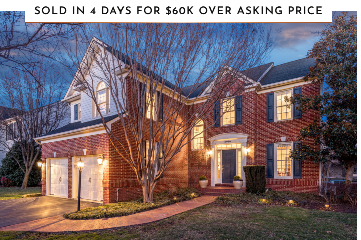
18980 LONGHOUSE PLACE 4 Beds · 3.1 Baths · 3120 Sq. Ft. · Sold for $900,000