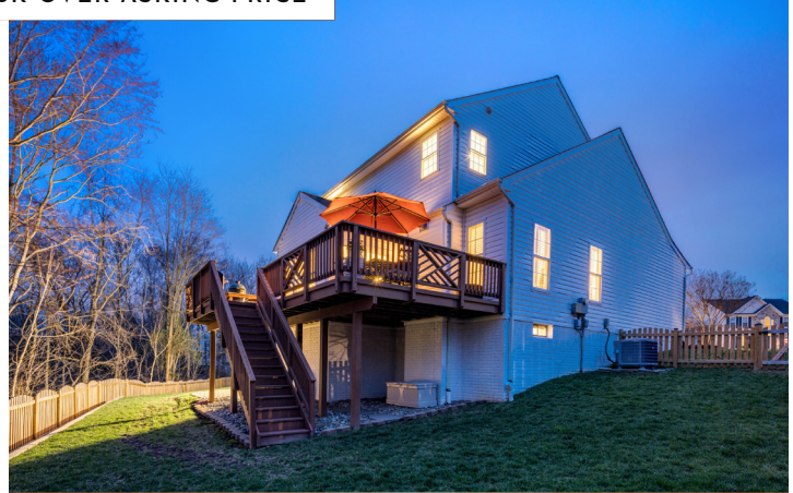
43168 MALLOCH PLACE 4 Beds · 3.1 Baths · 3,143 Sq. Ft. · Sold for $975,000