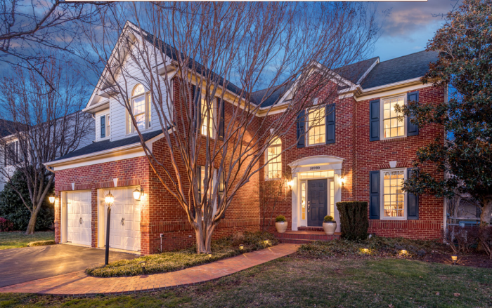
18980 LONGHOUSE PLACE 4 Beds · 3.1 Baths · 3,120 Sq. Ft. Sold for $900,000

18815 FARNHAM COURT 4 Beds · 5 Baths · 4,110 Sq. Ft. Sold for $975,000